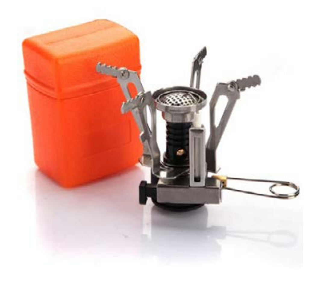
<u>Ultralight Backpacking Canister Camp Stove with</u> <u>Piezo Ignition 3.9oz</u>